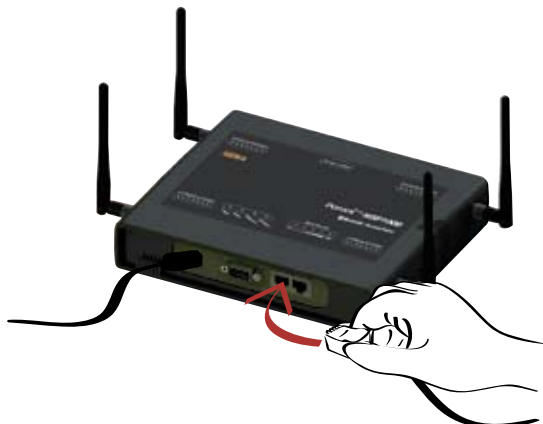
Connect Ethernet cable (ETH 0 Port)