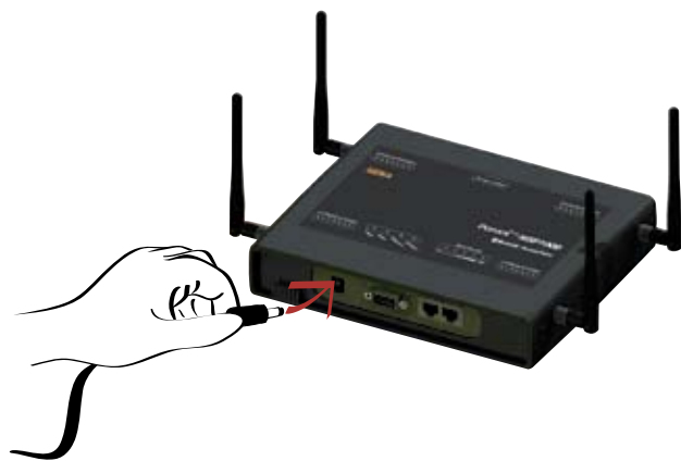
Connect Power supply