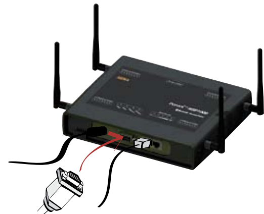
Connect to host PC (Console Port)